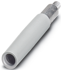
Female test connector, color: transparent

Please be informed that the data shown in this PDF Document is generated from our Online Catalog. Please find the complete data in the user's documentation. Our General Terms of Use for Downloads are valid ( http://phoenixcontact.com/download )